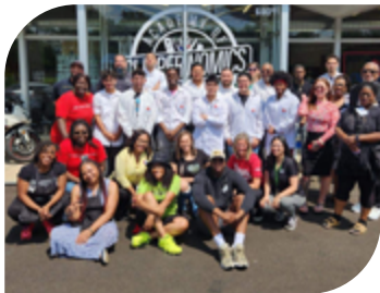
Mane & Maintain: A Gentleman's Grooming and Wellness Day 6/13

We love supporting your communities. Take a look at some of our recent events!