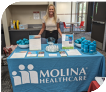
Future Fest Resource Fair 7/20