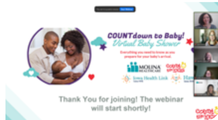
Virtual Baby Shower 9/14