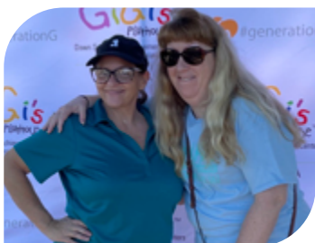
Gigi Fit 5k 8/12