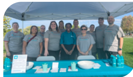
NAMI Walk 9/29