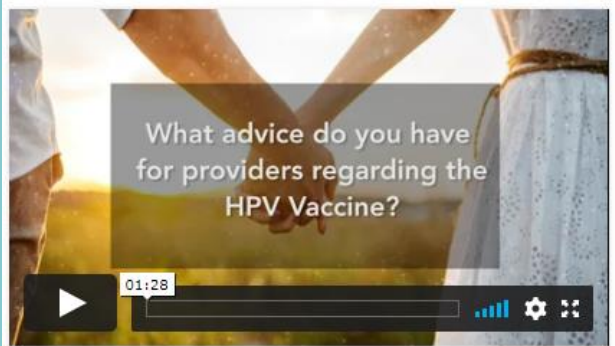
What advice do you have for p...

Kentucky doctor speaking about how safe and effective the vaccine is. Good for patient and community education. Providers' Videos :41