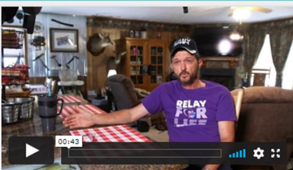
HPV Social Media #7

David message, send your kinds to get vaccinated. Social media message :43