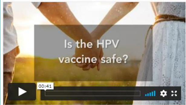
Is the HPV vaccine safe-