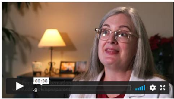
HPV Social Media #2

Kentucky Primary care provider sharing that HPV vaccine is safe, it is effective, and it works. Social Media Videos :38