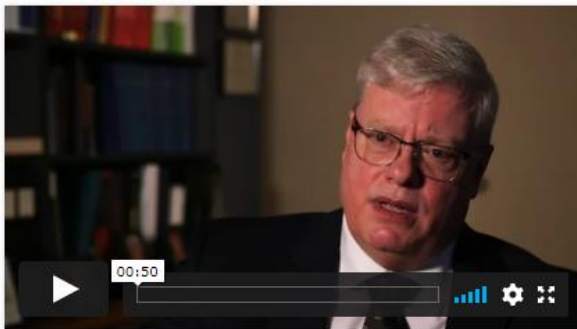
HPV Social Media #3

Kentucky Primary care provider sharing that HPV vaccine is safe, it is effective, and it works. Social Media Videos :38