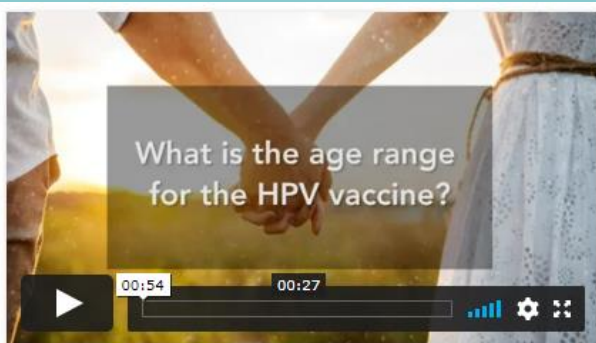
What is the age range for the ...

Kentucky doctor sharing how important the vaccine is for both boys and girls. Short message Good for patient and community education. Providers' Videos :32