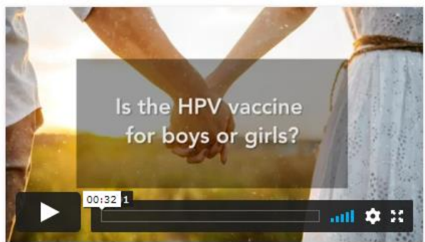
Is the HPV vaccine for boys or...

Kentucky doctor sharing how important the vaccine is for both boys and girls. Short message Good for patient and community education. Providers' Videos :32