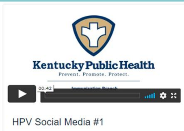
HPV Social Media #1

Kentucky doctors sharing what age range and optimal age range. Short message Good for patient and community education. Providers' Videos :27