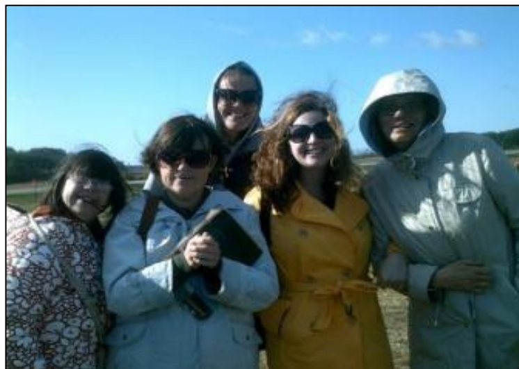
Rachel and her "circle of friends"

When we look at the things Rachel needed, we can see that they aren't much different than what we all want. By working