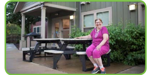
One of the residents of Movin' Out.

other than in their family's home or in a group setting. However, when a person has the support to succeed, many people thrive and gain more skills because of their new living situation.